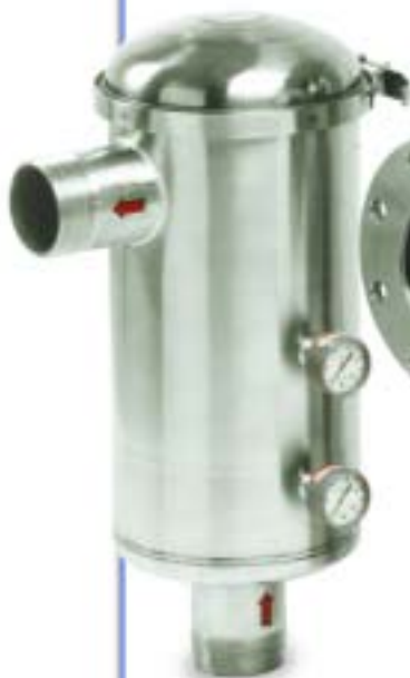
MLS-3 with optional pressure gauges