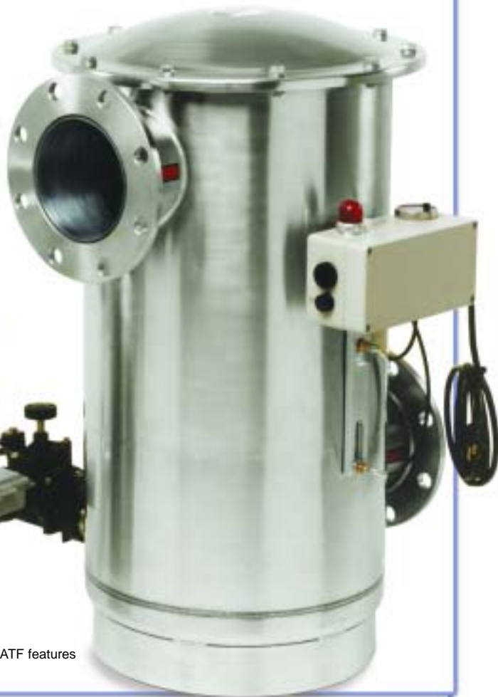
MLS-6 with optional PDA and ATF features