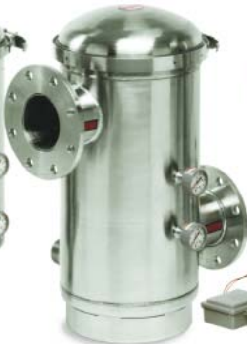
MLS-4 with optional pressure gauges