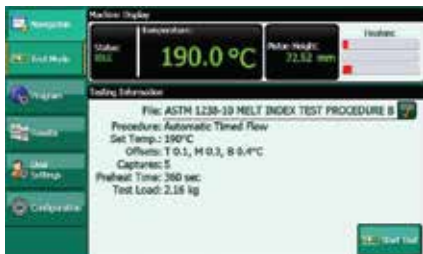
Home screen for manual MP1200