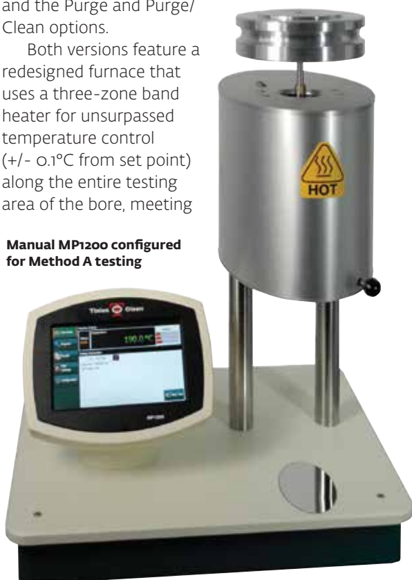
Manual MP1200 configured for Method A testing

the new requirements specified in ISO 1133-2. The furnace also features a quick action die release for easy removal of the die for cleaning after a test.