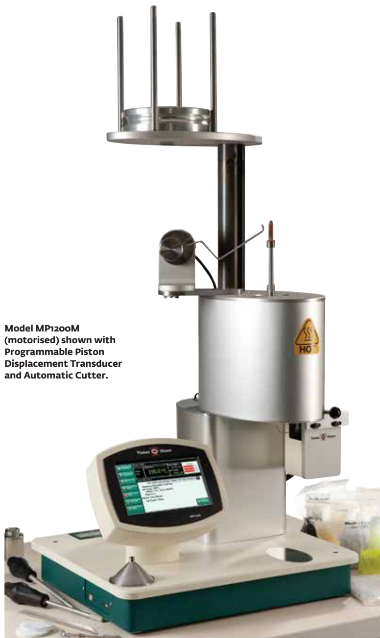
Model MP1200M (motorised) shown with Programmable Piston Displacement Transducer and Automatic Cutter.