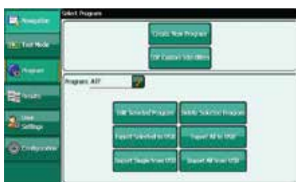
Home screen for MP1200M motorised